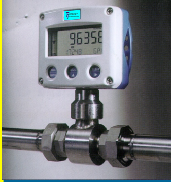
Direct mounting on flow meter