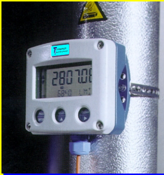
Pipeline mounting (vertical or horizontal)

...The new Turbines, Inc. FW series monitor is one of the most attractive, easy to use, rugged, durable and feature rich monitors on the market today.